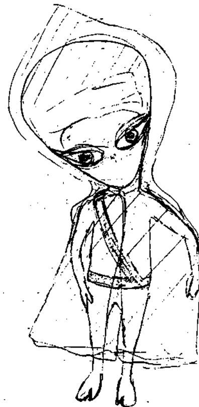
Sketch showing humanoids' greenish-black "cape"

The photographs arrived, and we arranged for the witness to meet with us to select the correct person from a group of eight ladies (all pretty much the same age). The photographs were taken 20 years ago, and the incident reportedly occurred 19 years ago. We simply placed the photograph of the eight ladies in front of her, and instructed her to identify Ingrid Swenson. She was given no prompting or other instructions. At first, she